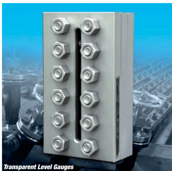
Transparent Level Gauges