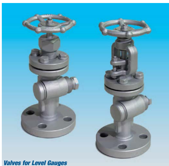
Valves for Level Gauges