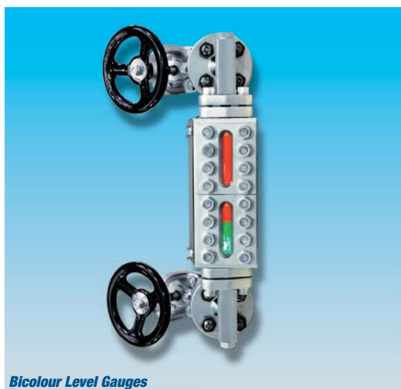
Bicolour Level Gauges