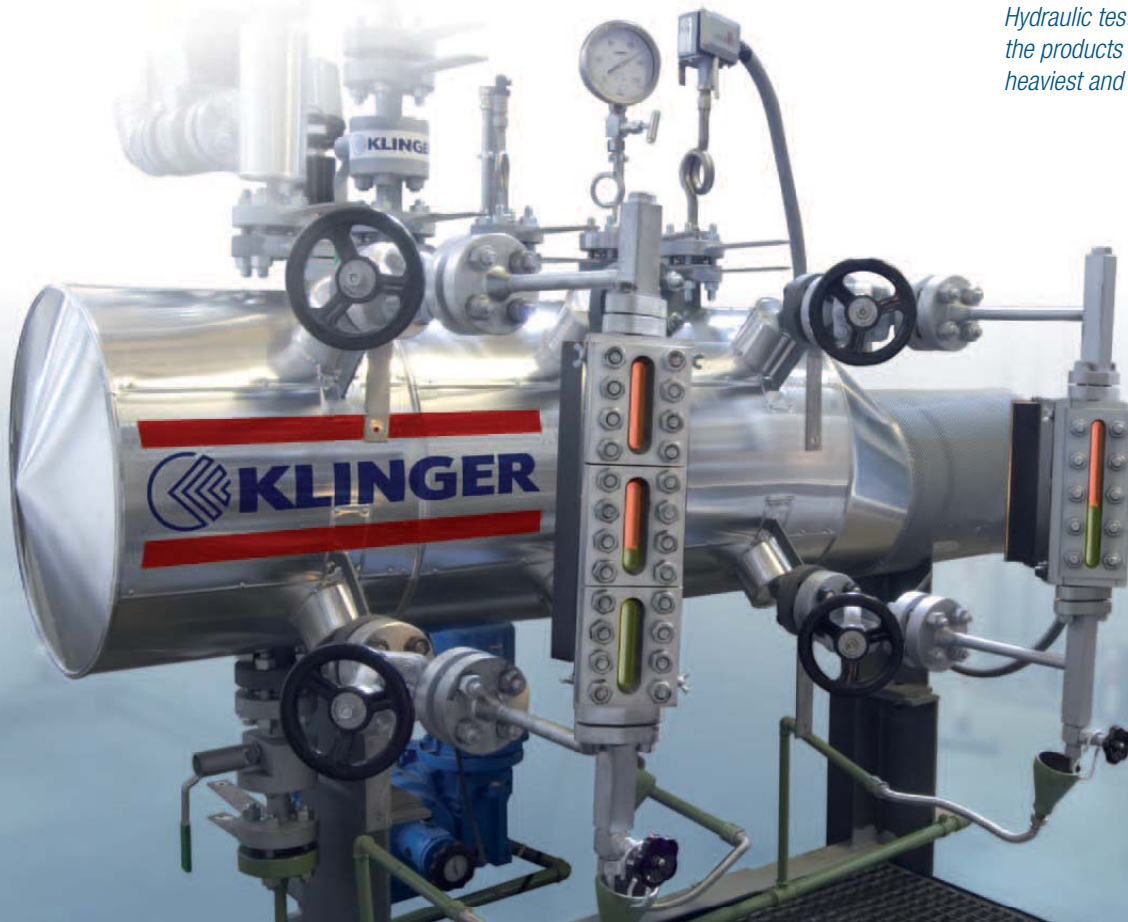
Steam boiler for high pressure steam test up to 225 bar

Although KLINGER has years of experience, its technology must be backed and confirmed by practical testing. A special boiler, installed at the KLINGER SpA plant, it is used to simulate extreme operating conditions by steam pressure up to 225 bar. Hydraulic test facilities are used to test the products up to 600 bar, with the heaviest and most critical conditions.